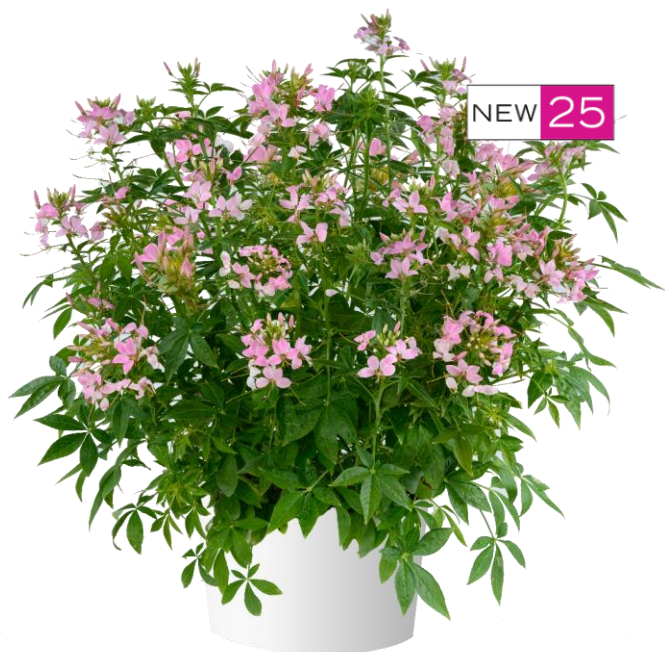
CLIO™ Pink Lady Imp.